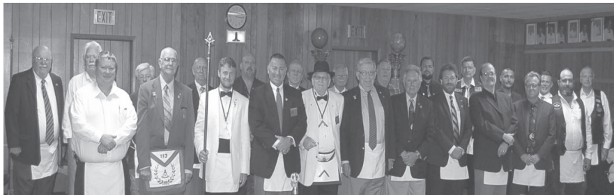
TWENTY-TWO FIRST TIME VISITORS

April 11, 2016 will go down in the BYKOTA history books as an all time record breaker. Of the 89 Brothers present, 15 were sitting or Past Masters; 8 past and current Potentates; 22 First Time Visitors, and two Lodges competing for the Traveling Gavel. Garden Lodge captured the gavel with 8 Brothers. Harmonia meets on the same night as BYKOTA, and they had 7 members in attendance. Plus a special thanks to District 33, Doric Lodge with 9 members attending.